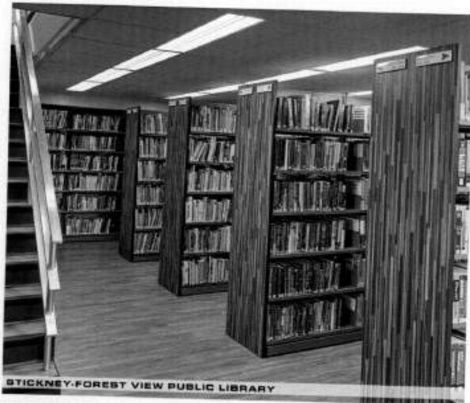
STICKNEY-FOREST VIEW PUBLIC LIBRARY

223 W JACKSON BLVD SUITE 1200 CHICAGO, IL 60608