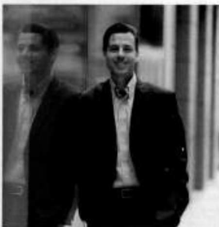
SHOREWOOD-TROY PUBLIC LIBRARY DISTRICT