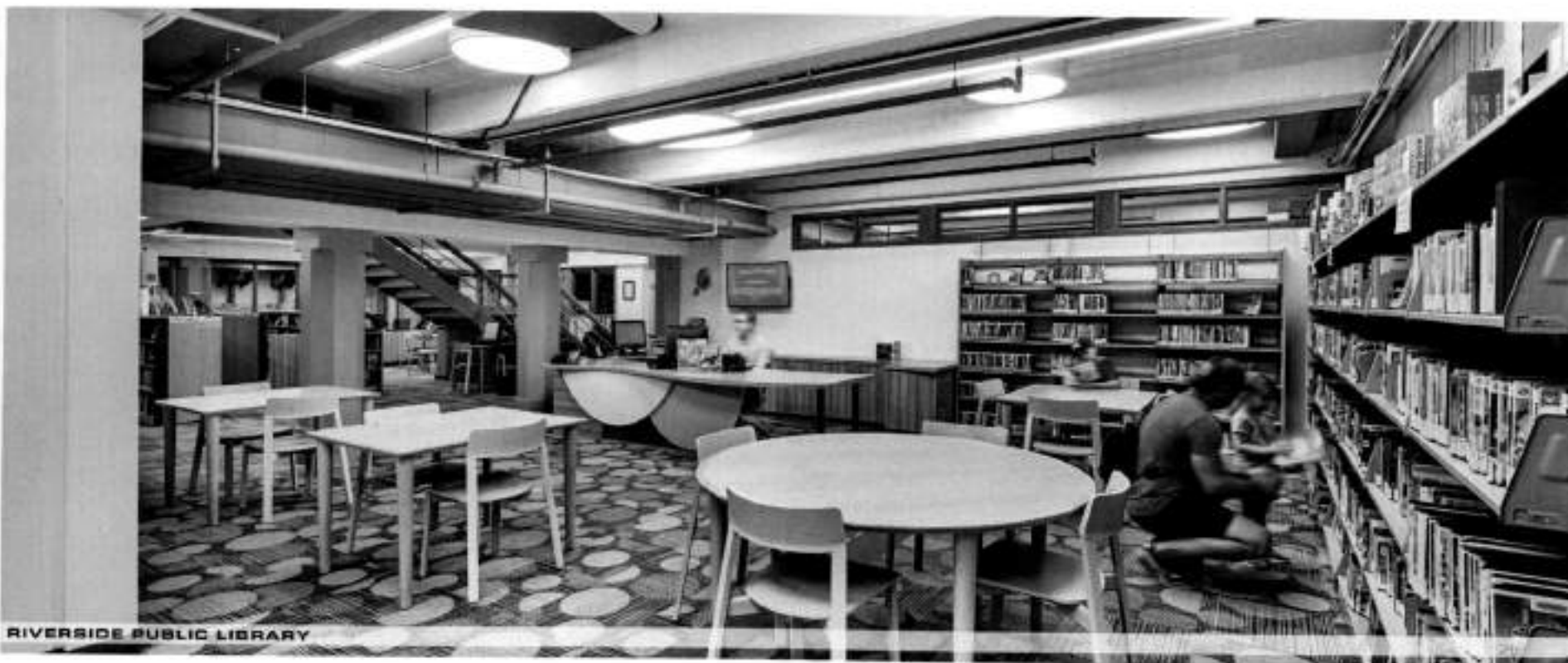
RIVERSIDE PUBLIC LIBRARY

At Studio GC, building relationships is very important to how we choose to serve the public. Our team will be ready to maintain our partnership and make the plans a reality for the library through construction. The same commitment, organization, and creativity that we will demonstrate through the design process will be carried over to construction and any ongoing services beyond. We hope that we will be able to demonstrate our commitment to the Shorewood-Troy Public Library.