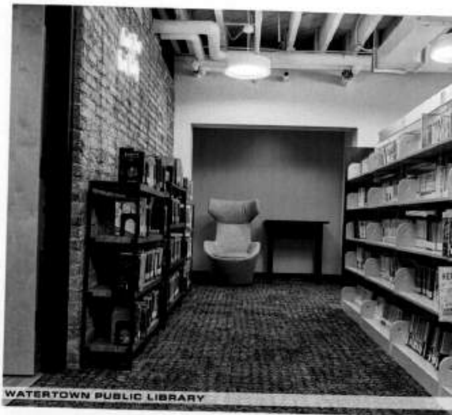
WATERTOWN PUBLIC LIBRARY