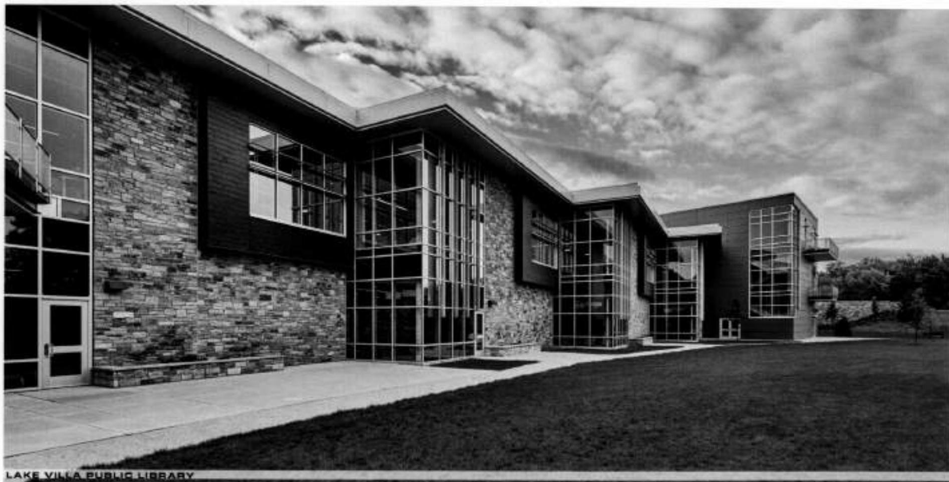
LAKE VILLA PUBLIC LIBRARY

The Studio GC Library Team has helped many libraries navigate repairs and enhancements to their operating facilities. We are confident that our library experience and crafted designs to solve these challenges will resonate with your leadership and enhance your library. We look forward to sharing those with you and to a lively discussion if we are invited to an interview.