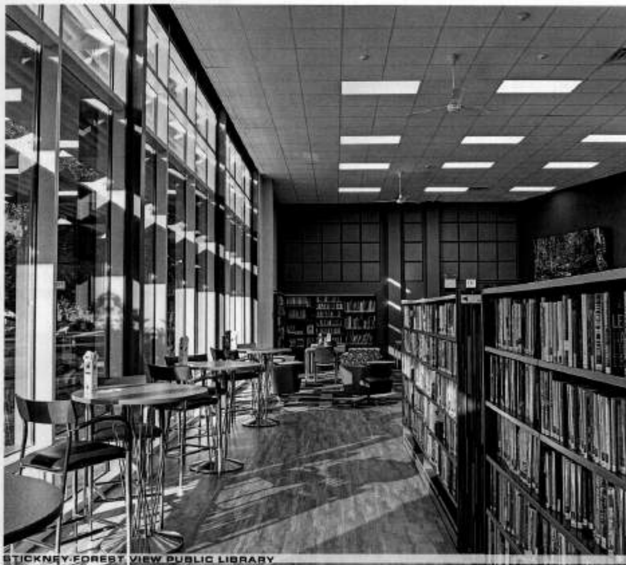
STICKNEY FOREST VIEW PUBLIC LIBRARY