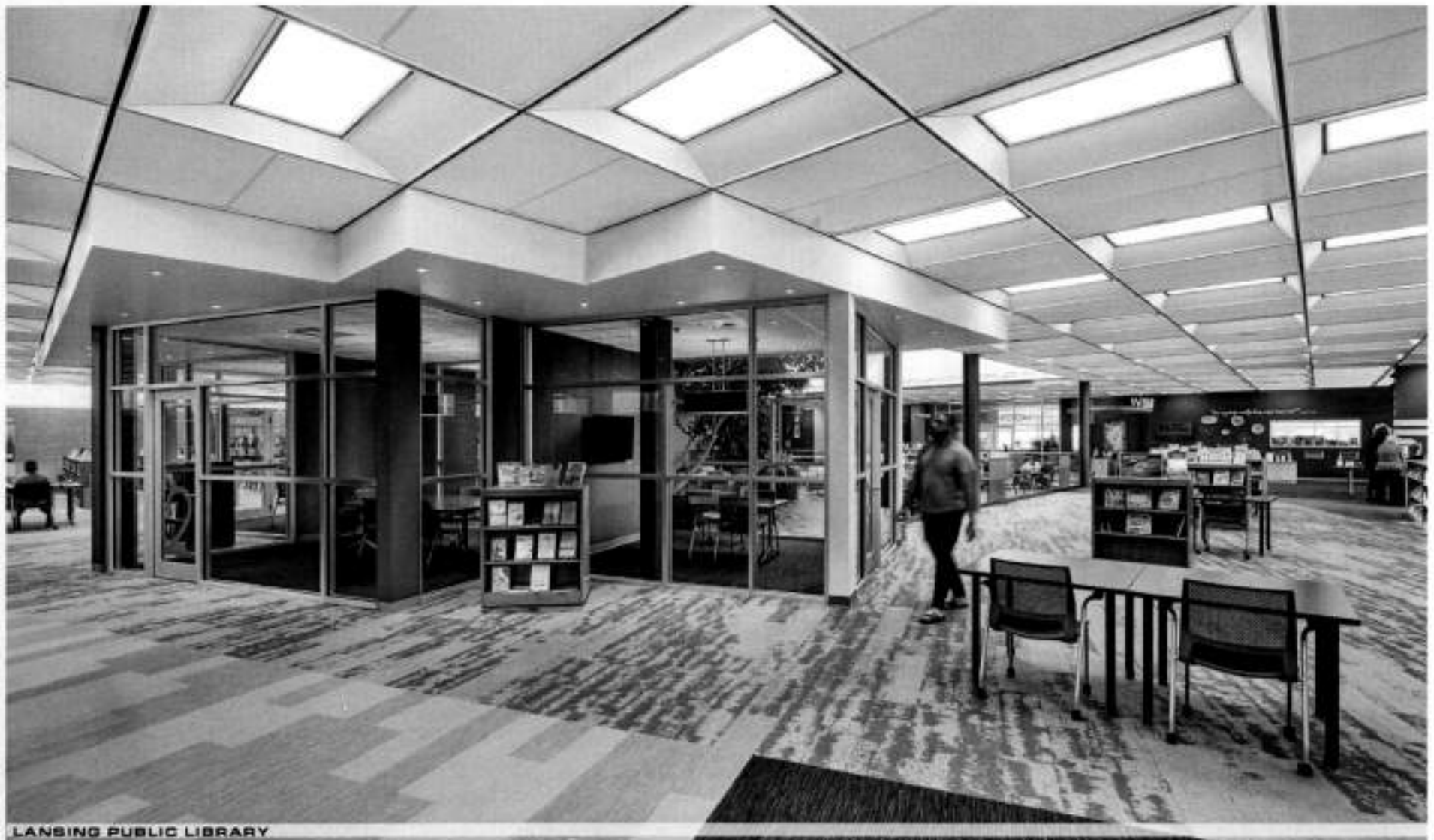
LANSING PUBLIC LIBRARY