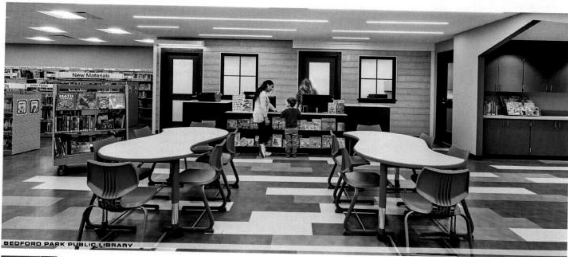
BEDFORD PARK PUBLIC LIBRARY

Managing workload is an essential part of our practice. For more than 33 years, Studio GC has consistently achieved desired client outcomes by completing our assignments timely. Before pursuing new client opportunities, we evaluate current staffing, assignment mix, and management capacity. Project progress is reviewed weekly by the firm's management team and resources are maintained or modified accordingly. We assure you that we can provide all necessary resources to Shorewood-Troy Public Library to provide the responsiveness and service that is expected of a true partner. Internally, we have already committed our team members to your project.