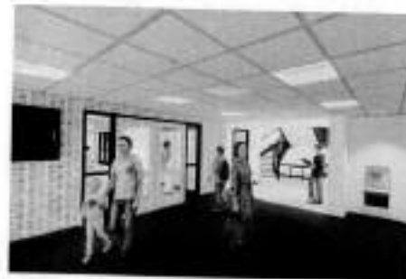
Whiting Public Library Whiting, IN Services: Renovations Completed: Ongoing since 2022